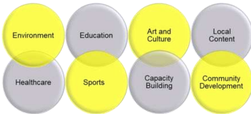
Figure 1. SRI Categories

Contractors’ initiatives go through the following process: