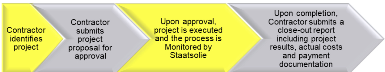
Figure 2. SRI Process Flow

In 2025, 19 Contracts were active and this report provides a summary of the SRI projects completed and approved during the year, in fulfillment of the obligations under these Contracts.